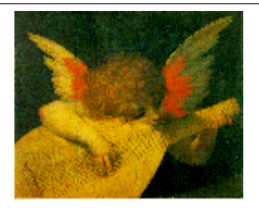
HEBE'S WEB at www.hebesweb.com